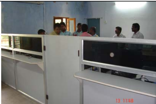
Front View of Revenue Kiosk