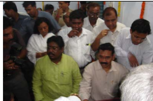
Sri Madhu Koda,Hon'ble Chief Minister , Sri Dulal Bhuiyan ,Hon'ble Minster of Revenue & Land Reforms and Smt Sunman Mahato, Hon'ble Member of Parliament ,Jamshedpur inaugurating the revenue Kiosk