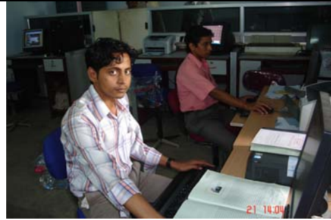
Operators working at Revenue kiosk